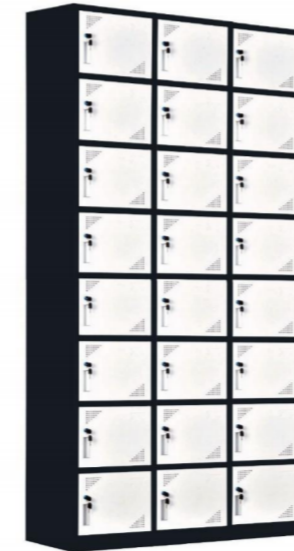
SYL-3-8 H1850*W900*D400mm 0.139 cbm