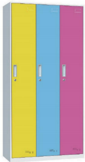
SYLN-3-1 H1850*W900*D450 mm 0.157 cbm

SYLN-1-1/2/3/4/5/6 H1850*W380*D450mm 0.07 cbm