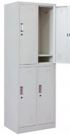
SYL-2-2 H1850*W608*D450mm 0.13 cbm