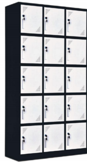
SYL-3-5 H1850*W900*D400mm 0.139 cbm