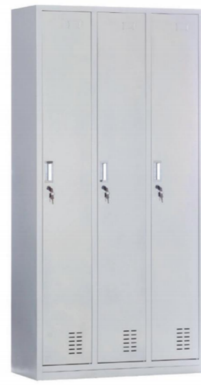
SYL-3-1 H1850*W900*D450mm 0.139 cbm