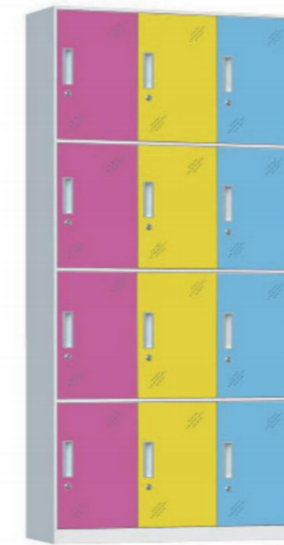
SYLN-3-4 H1850*W900*D400 mm 0.192 cbm