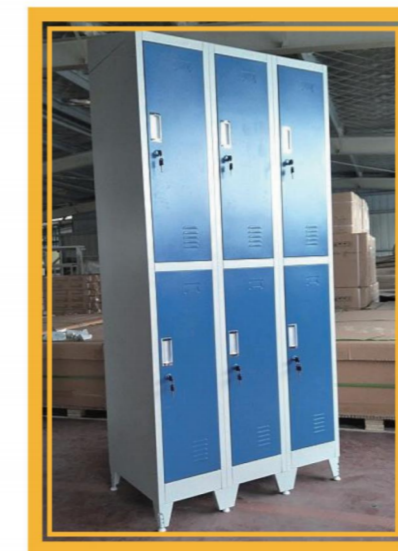
Locker with slope top/adjustable feet