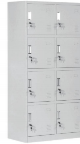
SYL-2-4 H1850*W900*D450mm 0.139 cbm