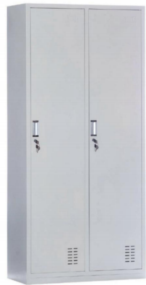
SYL-2-1 H1850*W900*D450mm 0.139 cbm