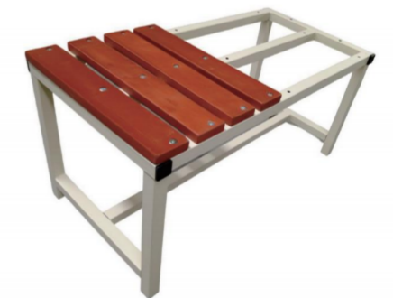
SYL-B H400*W380*D750mm 0.015 cbm