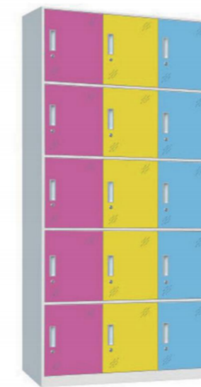
SYLN-3-5 H1850*W900*D400 mm 0.192 cbm