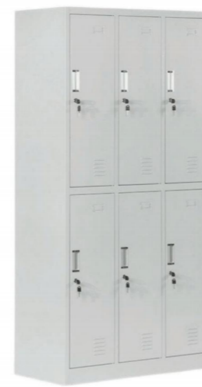
SYL-3-2 H1850*W900*D450mm 0.139 cbm