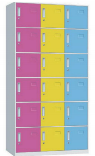
SYLN-3-6 H1850*W900*D400 mm 0.192 cbm