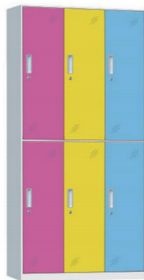
SYLN-3-2 H1850*W900*D450 mm 0.157 cbm