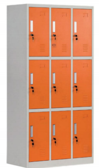
SYL-3-3 H1850*W900*D400mm 0.139 cbm