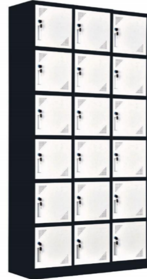
SYL-3-6 H1850*W900*D400mm 0.139 cbm