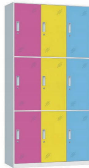
SYLN-3-3 H1850*W900*D400 mm 0.157 cbm